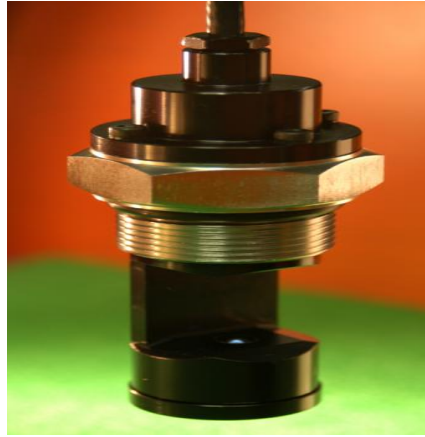
Integrated Oil-Quality Sensor Prototype

The sensor is a reliable and cost-effective device to maximize oil useful life, filter life and equipment reliability, thereby minimizing maintenance costs and machinery downtime. Likewise, the environmental impacts of used oil and filter disposal are also minimized. The sensor is a fraction of the cost of sensor suites that measure the same parameters.